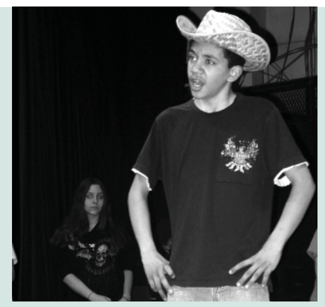
Roosevelt Arts, Communication & Technology School presents