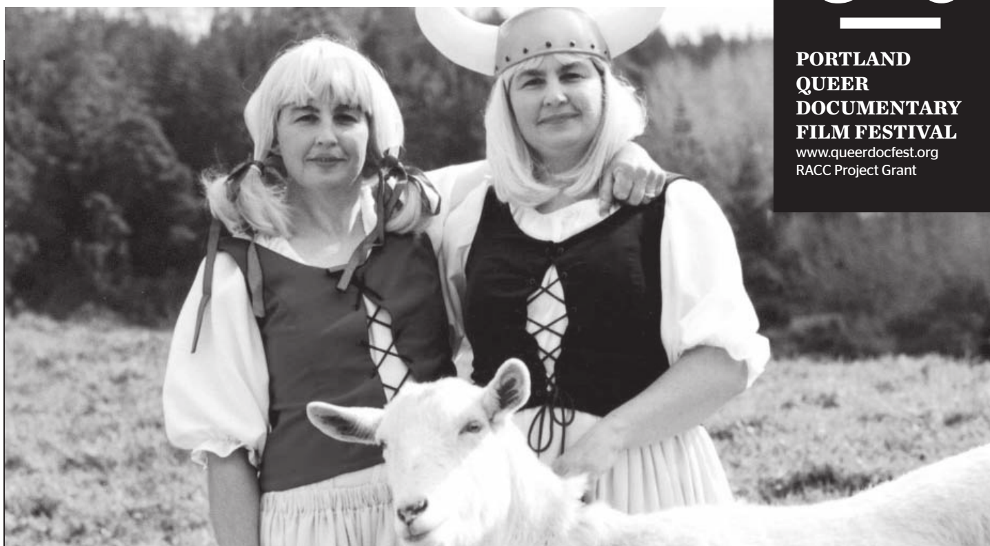
(From the film The Topp Twins: Untouchable Girls )