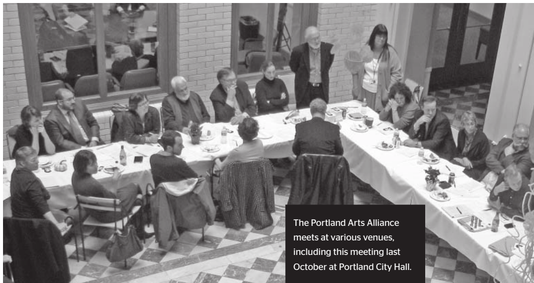
The Portland Arts Alliance meets at various venues, including this meeting last October at Portland City Hall.

When arts organizations collaborate to tackle tough issues, the entire community benefits. Here are just some of the partnerships taking place in our region.