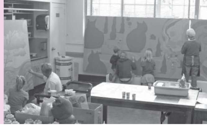
For more visit www.multnomahartscenter.org