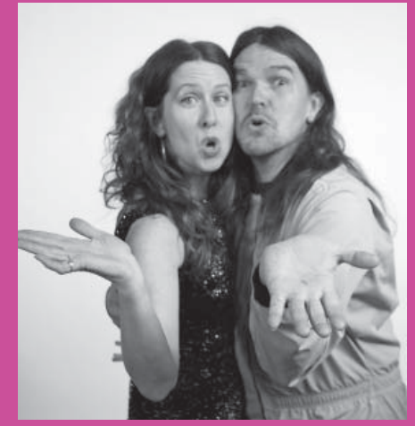
RUSH-N-DISCO 9/10