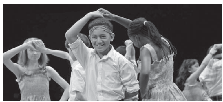
Sacramento Elementary students perform at the Mad Hot Ballroom Gala sponsored by Young Audiences, one of Work for Art's funded organizations.

For the third year in a row, Work for Art has shown dramatic increases in its yearly workplace giving campaign. This year, despite economic challenges, Work for Art increased its total annual giving by 19 percent – closing out the 2008-09 campaign year on June 30 with a total of $665,863 raised.