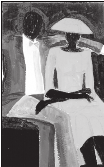
(Left) Easter, 1989 Jonathan Green (1955- ), acrylic on paper ~ As the signature work of this exhibition, Green’s painting encapsulates the themes of the show: celebration and vision.

Celebration and Vision: The Hewitt Collection of African-American Art will be on display, free of charge, Monday through Saturday from 10 a.m. to 5 p.m. and Thursdays until 7 p.m. in the Littman Gallery of PSU’s Smith Memorial Student Union (1825 SW Broadway, 2nd Floor). For more information, call 503.725.5031; to volunteer as a docent for the exhibit, call 503.725.5656.