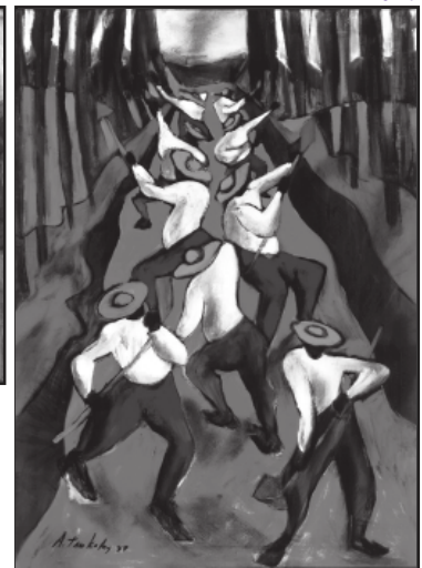
(Right) Canal Builders II, 1989 Ann Tanksley (1934- ), oil on linen ~ Combining unity and movement, this piece is based not only on Tanksley's enduring interest in the condition of the black laborer, but with conversations with her cousins who worked on the Panama Canal.