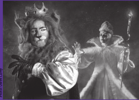
"The Lion, the Witch and the Wardrobe" by C.S. Lewis will be presented by the Oregon Children's Theatre on Jan. 11, 24 and 25. Call 503.228.9571. RACC provides Operating Support Grants to Oregon Children's Theatre.

A Room of Her Own Foundation: 2003-04 Literary Gift of Freedom Award is for women writers of creative nonfiction. Award $50,000 over 2 years. See details www.aroomofherownfoundation.org . Postmarked Deadline: 2/1/04.