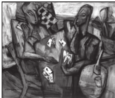
(Above) The Card Players, 1978 Hale Woodruff (1900-1980), oil on canvas ~ Woodruff incorporated cubism's interest in African art into his paintings.