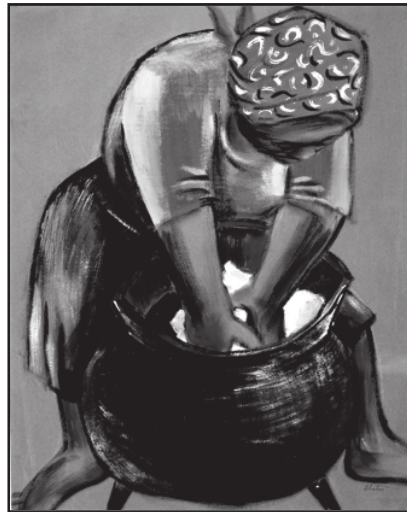
(Right) Woman Washing Clothes, ca. 1970 Charles Alston (1907-1977), oil pastel on paper ~ During the 30s, Alston was among the first African-American artists to execute a major mural project for the Works Progress Administration (WPA).