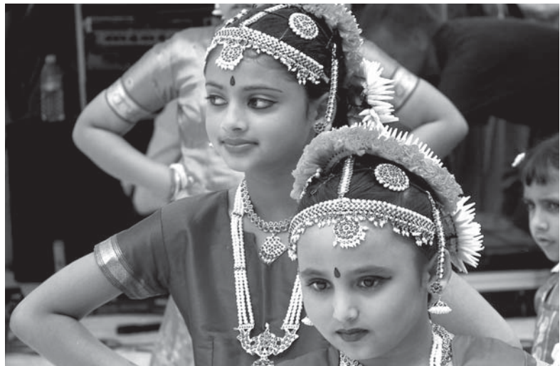
The 14th Annual India Festival has just received a 2008 RACC Project Grant. This Festival will take place August 17, 2008 at Pioneer Courthouse Square.

The Regional Arts & Culture Council has awarded $407,462 to 47 organizations and 44 individual artists who will be offering artistic programs for the general public throughout the tri-county area in 2008. Funds for these projects come from the City of Portland, Multnomah County, Clackamas County, Washington County, Metro, and Work for Art, RACC's workplace giving program.