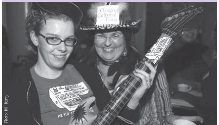
Kick It to Culture! Representatives from the Rock n' Roll Camp for Girls, the Oregon Cultural Trust, and other art organizations received year-end donations from art supporters at this gathering on December 10th at PCPA.

For updates: www.racc.org/resources/RACCopportunities