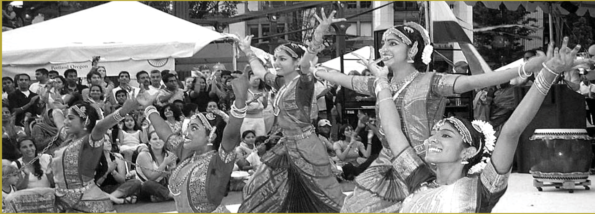
August 20. The India Festival will be celebrated in Pioneer Courthouse Square in Portland. The Festival is filled with tastes, sounds and sights of India. There will be live music, excellent dance performances, food and entertainment! This event was sponsored in part by a RACC Project Grant, now available for application for events in 2007 (See Page 2). For more on the India Festival see www.icaportland.org .