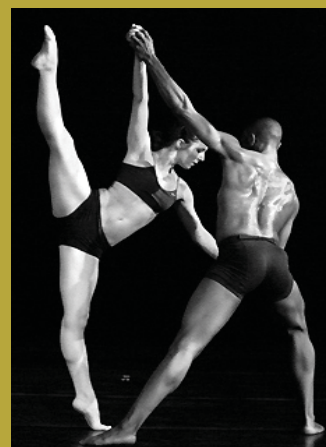
July 42-August 12 Northwest Professional Dance Project

For much more: www.racc.org/resources/other