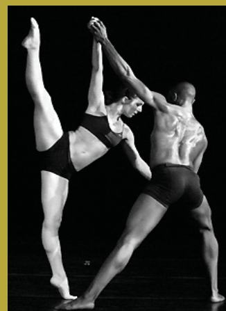
July 42-August 12 Northwest Professional Dance Project

For much more: www.racc.org/resources/other