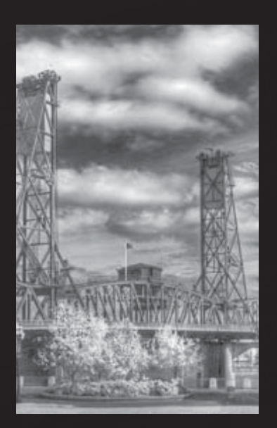
Portland Bridge Festival July 23-August 8