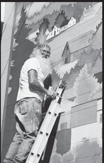
Estacada Summer Celebration July 23-25