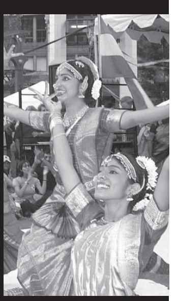
India Festival August 15

Celebrate summer and bring your family to a variety of festivals scheduled for the tri-county region. See details for each Festival at www.racc.org/calendar. The Portland Bridge Festival is funded in part by a RACC Opportunity Grant; Bastille Day, Estacada Summer Celebration and India Festival are funded in part by a RACC Project Grant. RACC Project Grant applications are now available for activities in 2011. Apply online at www.racc.org/GrantsOnline. Intent to Apply Deadline: 8/4/10, 5pm.