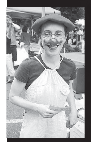
Bastille Day Festival July 10