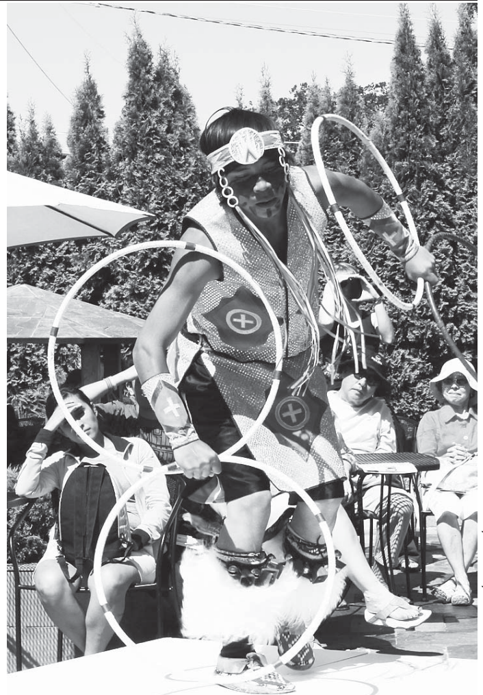
Photo: A Painted Sky dancer

CALL FOR SCULPTURES. The Milwaukie (OR) Arts Committee invites sculptors to submit proposals for Milwaukie's outdoor sculpture garden with theme "The Elements of Nature." http://bit.ly/K2qTgU . DEADLINE: 8/3/12