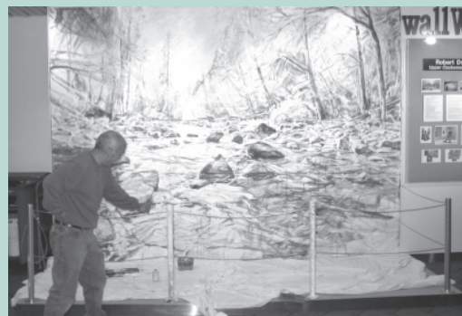
"Upper Clackams River #5" by Robert Dozono (above). The final wallWORKS at the Portland International Airport (near security checks for Concourses D & E) on exhibit until March 31. The wallWORKS:PDX project was funded by Interspace Airport Advertising and administered by RACC. Since 2001 the project has featured eight Portland area artists creating murals on-site. Due to space restrictions, the program will come to an end in March.

For more: www.racc.org/News/artnotes/ANClass.html