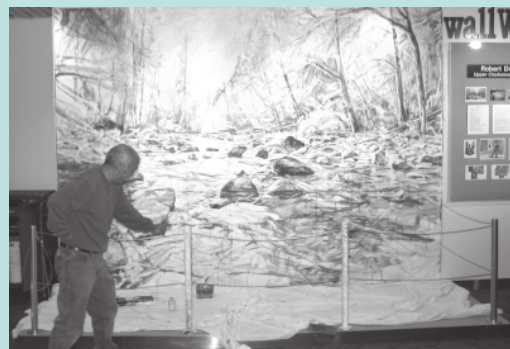
"Upper Clackams River #5" by Robert Dozono (above). The final wallWORKS at the Portland International Airport (near security checks for Concourses D & E) on exhibit until March 31. The wallWORKS:PDX project was funded by Interspace Airport Advertising and administered by RACC. Since 2001 the project has featured eight Portland area artists creating murals on-site. Due to space restrictions, the program will come to an end in March.

For more: www.racc.org/News/artnotes/ANClass.html