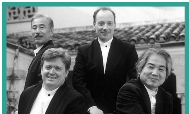
The Tokyo String Quartet is regarded as one of the supreme chamber ensembles of the world. Performing March 13-14 at the Lincoln Performance Hall at PSU. Visit www.focm.org . Friends of Chamber Music receives General Support funding from RACC.

For much more: www.racc.org/resources/other