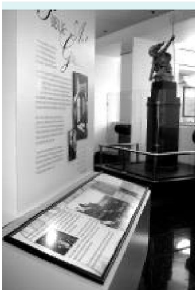
<LEFT The newly redesigned Public Art Gallery in the Portland Building on the 2nd floor.