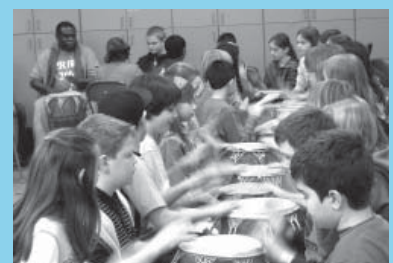
Students at the French American School enthusiastically participate in a drumming class during a residency by Portland Taiko.