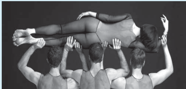
BodyVox's The Big Room will be presented at the Newmark Theatre from May 17-20, featuring a special section choreographed to the music of Mozart for Portland's Month of Mozart. BodyVox receives General Support funding from RACC.