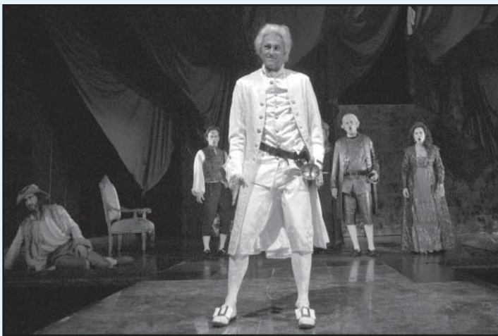
Portland Opera's 2005-06 season of "Power and Corruption" concludes with four performances of Wolfgang Amadeus Mozart's Don Giovanni on May 13, 16, 18, 20. This is one of the final events of the citywide Month of Mozart series. Portland Opera receives General Support funding from RACC.

Read the Candidates Responses at www.racc.org/advocacy/local