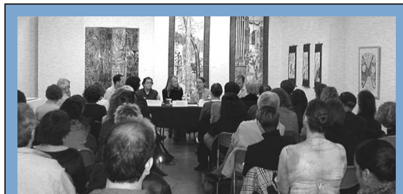
Previous RACC workshop, part of the Talent to Enterprise Series, was held at Blackfish Gallery in April 2005 and featured local gallery owners and curators.