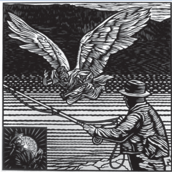
Dennis Cunningham Visitation , 1985 Linocut, 28 x 29 inches © 1985 Dennis Cunningham. City of Portland/Multnomah County Portable Works Collection

The Cultural Trust gives to Oregon arts, heritage and humanities. Contribute to any of Oregon's 1,200 cultural nonprofits. Then, make a matching gift to the Trust to receive a 100% tax credit. Culture rewards us in countless ways. Claim yours at www.culturaltrust.org .