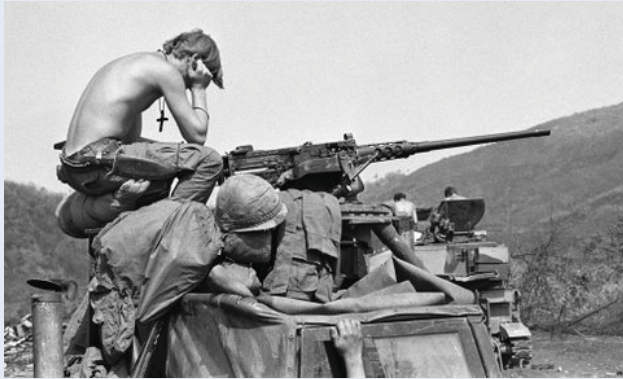
Photo: Easter Sunday near Khe Sanh, Vietnam, 1972