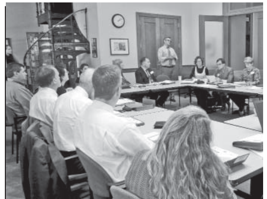
Community leaders on the Any Given Child committee met at City Hall to blueprint the elements of a comprehensive arts education.