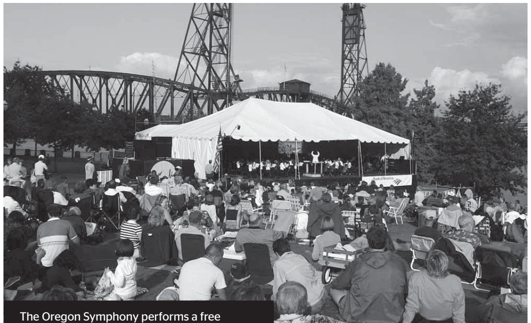
The Oregon Symphony performs a free concert in Waterfront Park every summer.