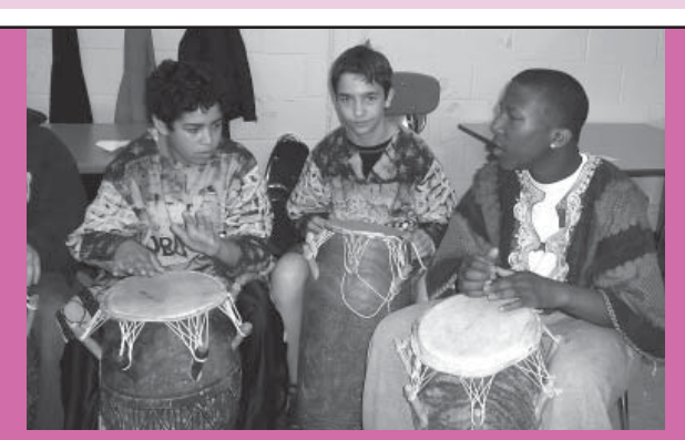
Students at Open Meadow Middle School take drumming lessons from Homowo artists. Funded by a RACC Fast Track Grant in spring, 2006. Fast Track Grant applications now available at www.racc.org.