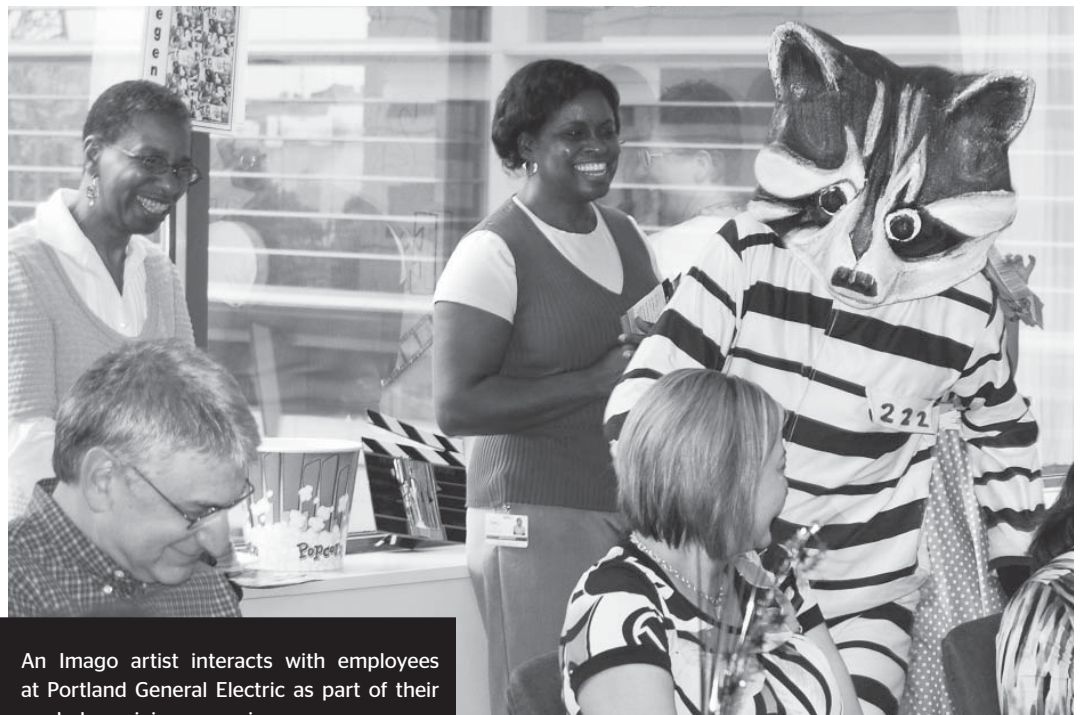
An Imago artist interacts with employees at Portland General Electric as part of their workplace giving campaign.

With broad support from many of the region's leading companies, Work for Art endeavors to raise $850,000 by June, 2012