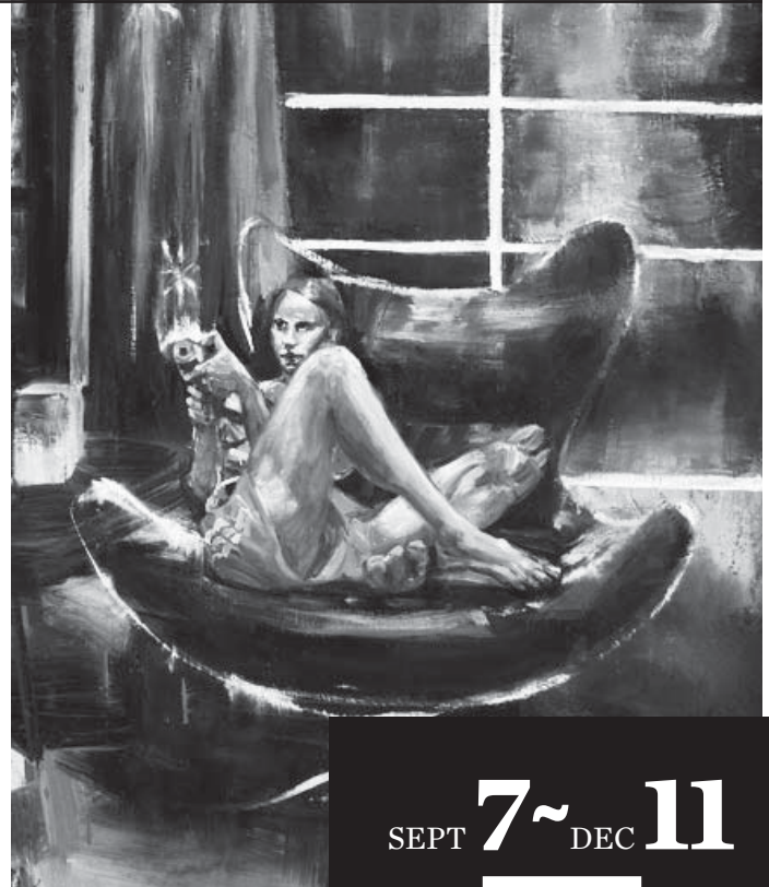
Detail from Remote: Laura Ross-Paul (2011).

Portland Center Stage pcs.org , 503.445.3700