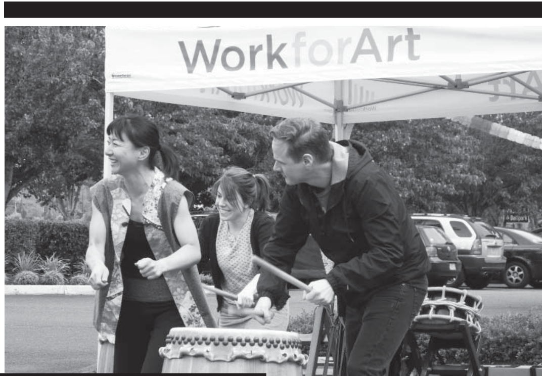
Portland Taiko drums with employees during a Work for Art campaign event at LAIKA's studio in Hillsboro.