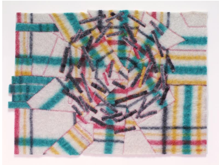
Marie Watt, Part and Whole: Ripple, Hoop, Baron Mill , reclaimed wool blankets and thread, 2011. Currently installed at the Portland Building.

PSU, PCC, OHSU, and the City of Portland join together in one building to share resources, enhance programs, and further expand their impact in our communities. This vibrant ecology of collaborators work together toward climate protection, energy efficiency, green building, and sustainability. Natural light fills the building, creating comfortable environments to work and learn, whether in introspection or interaction. The building's guiding principles center health and include wellness , universal access, social justice, and equity. Through this dynamic partnership, the building holds collaboration and connectivity at its core.