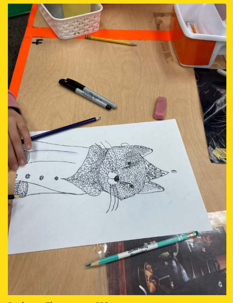
Buckman Elementary - PPS