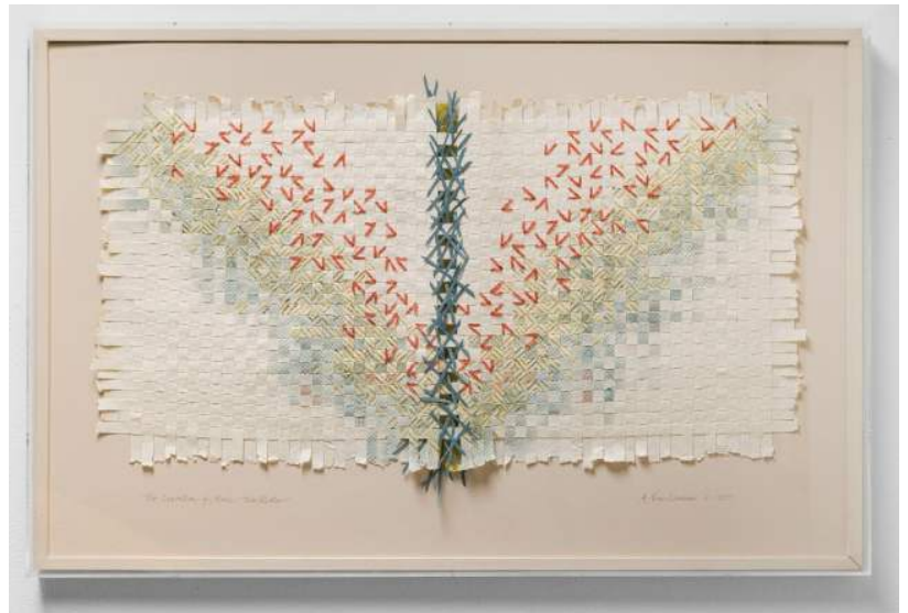
The Invention of Music: The Rattle , Alice Van Leunen, paper (fiber product), mixed media, City of Lake Oswego Collection, 1989

Please submit your application by July 28, 2024 at 11:59pm