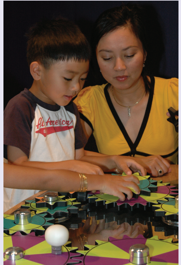
Vietnamese-Americans at the Children's Discovery Museum of San Jose, California.

Early on, museum staff held focus groups to determine barriers to participation; they incorporated Vietnamese cultural icons, such as bamboo and circles (a Vietnamese round boat, a rice sieve), into exhibits and added Vietnamese to the English and Spanish signage in the museum. They addressed a cultural perception, especially prevalent among Vietnamese Americans born outside of the United States, that museums were “passive, old and academic” rather than interactive and engaging places and—even more challenging—that the kinds of important educational experiences parents and grandparents were seeking for their children could be educational even while encouraging fun and play.