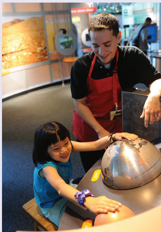
An Explainer with a visitor at "The Search for Life Beyond Earth," New York Hall of Science.

a diverse group of young people. 64 This may serve as a model for museums that want to diversify their staff as well as their visitors.