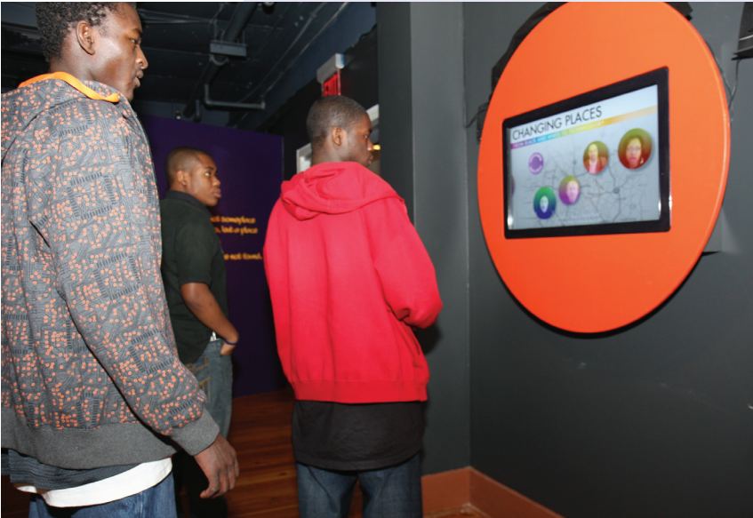
Students decide which video to select from a touch screen, before entering a video-talkback booth at “Changing Places” to record their own stories.

The Levine Museum of the New South in Charlotte, N.C., has taken its commitment to “fostering understanding in the community, celebrating diversity and acting as a catalyst of community dialogue” to new levels by explicitly developing exhibits and civic efforts to deal with the changing demographic composition and racial and ethnic group dynamics of its city and region. When Harvard political scientist Robert Putnam’s Social Capital Community Benchmark Survey 51 identified Charlotte as being low on levels of inter-group trust, the Museum began developing exhibitions specifically around issues of race, racism and trust. First was “Courage” in 2004, exploring the history of school desegregation. The museum partnered with the Community Building Initiative to organize an extensive program of small group dialogues that brought professionals from across the city to the museum for focused discussions. They re-envisioned the museum as a model insti-