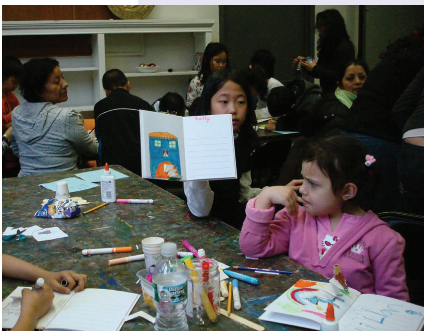
The Nassau County Museum of Art uses art to enhance literacy among immigrants.

The program has proven to be highly popular with participants. Thanks to a National Leadership Grant from IMLS, the museum and community college staffs are now collaborating on plans to develop a teaching institute and a model curriculum that can be shared with other cultural and educational institutions. The beauty of the CALTA program is its versatility; it is also used in family programs that allow separate, but interconnected, intergenerational activities, engaging everyone without disempowering the adults who may not have the same English proficiency as their children. It offers English language learners a means of finding a voice in a new culture and, for some, new modes of critical expression. It is a program that positions the museum as a key player in helping ease the transition of new immigrants into their American communities. 46