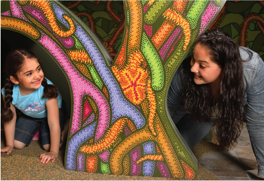
Visitors peer through colorful kelp at the Monterey Bay Aquarium.

In 1998, only 8 percent of visitors to the Monterey Bay Aquarium were Hispanic, despite a growing Latino population in California's Monterey Bay area and neighboring regions. In 2002 the aquarium launched a major marketing initiative to change local perceptions that the institution was aloof, expensive and remote. First, the staff identified that its Latino audience was, in fact, two audiences: one, highly acculturated Latinos whose household incomes were higher than the California average; the other, largely unacculturated Latinos, who were newer immigrants, predominantly Spanish-speaking, with larger families and lower incomes. The museum increased its marketing efforts to attract more acculturated Latinos from across California to choose the aquarium as a destination. For the second target group, however, the staff developed a campaign to overcome negative perceptions of the aquarium. They advertised in Spanish on television, radio and in local newspapers; they offered discounts, organized special events