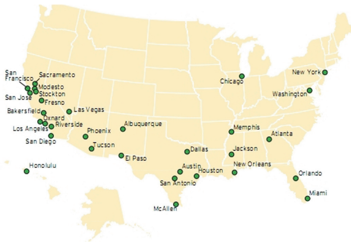
Figure 4. Metro areas in which less than half of people under age 15 are non-Hispanic white (2007)

Source: Frey et al, Getting Current: Recent Demographic Trends in Metropolitan America (Washington, D.C.: Brookings Institution, 2009)